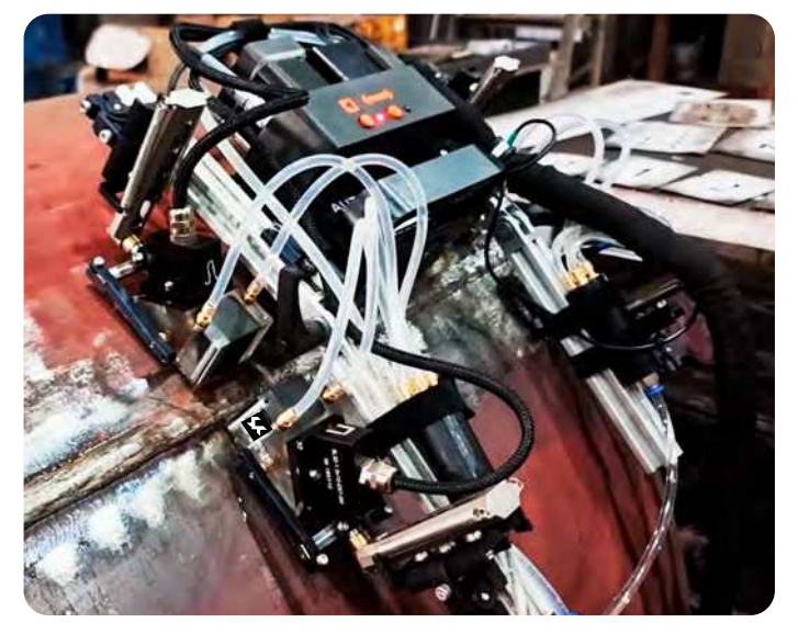
The AutoPAScan can be used in configuration with 1 PA or 2 TOFD probes.

The flaw detector is able to operate with a 2D coordinate encoder, recording B-Scan The results can be analyzed in real time on the device or on PC. This makes the flaw detector a convenient tool for mechanized ultrasonic testing.